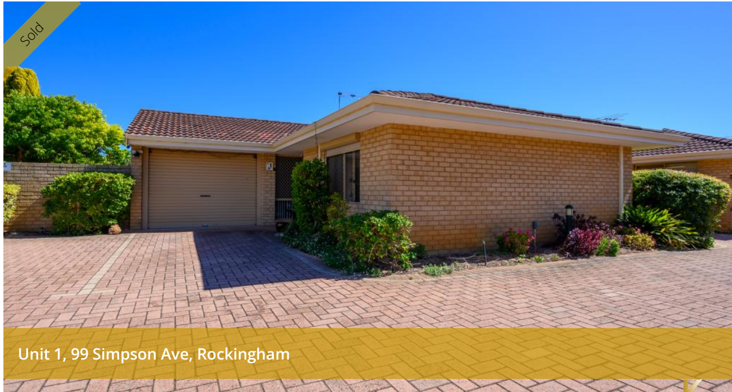
Unit 1, 99 Simpson Ave, Rockingham